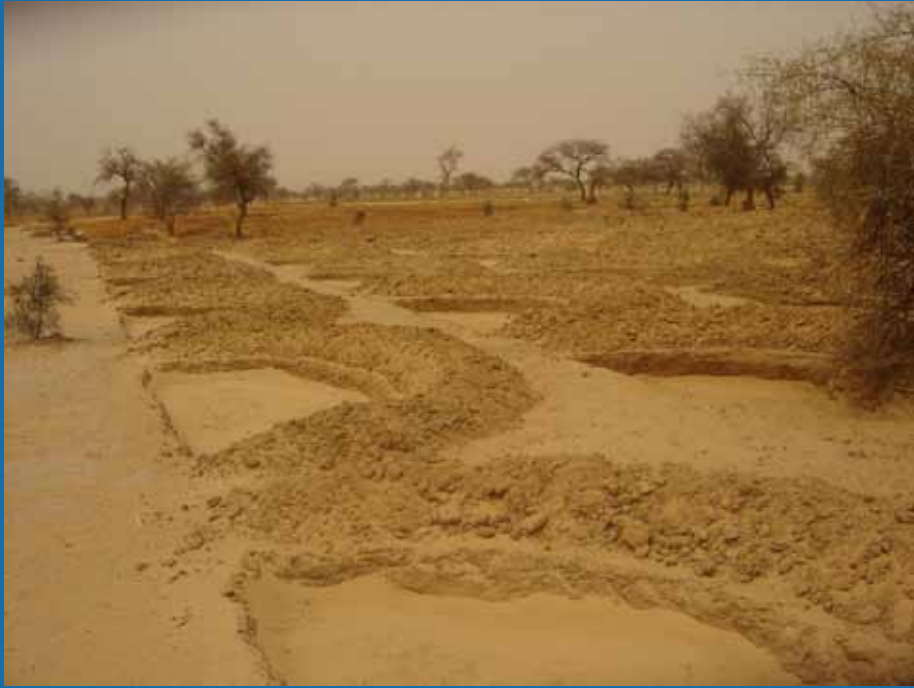
Freshly recuperated field of half moons outside Daibery, Tillabery.