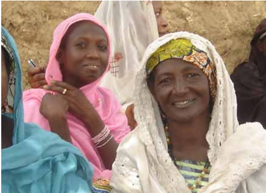
Cash for Work recipients awaiting payment. Daikaina, Tillabery.

benefit with smaller proportions of CRS' assistance. In one community, for every household selected, a neighbor's household was assigned who would also work on the site and receive half of the payment. In another community, the cash is equally distributed among all residents. More investigation is needed into the targeting method used in the other villages and participants' level of satisfaction with it.