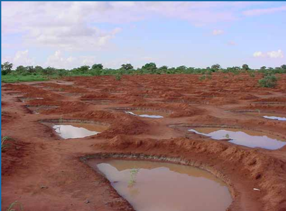
Water captured by recently dug half moons. Souradja Mahaman