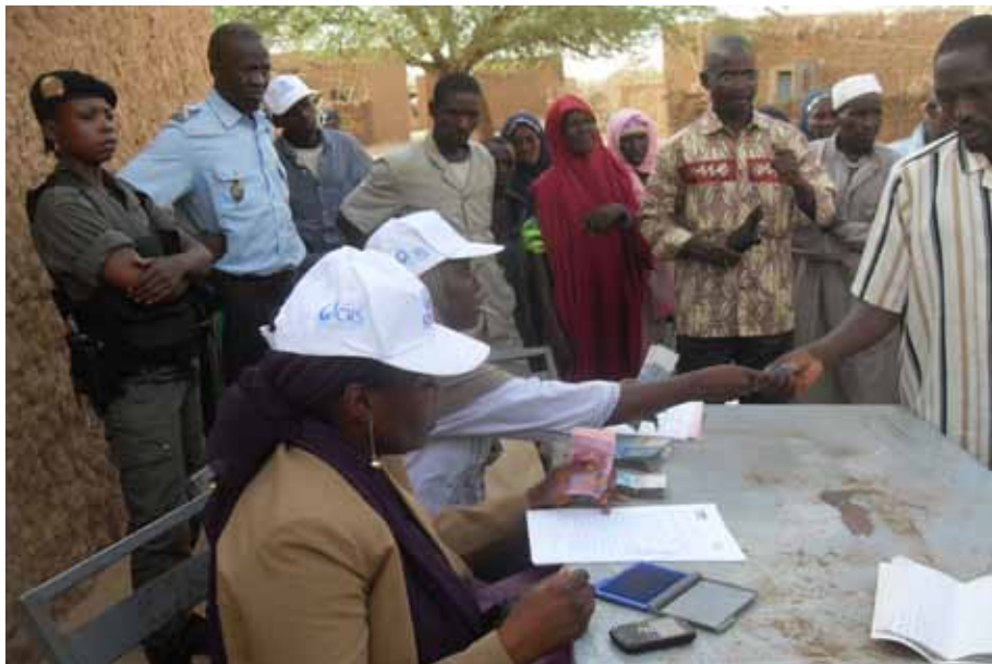
Bank officers pay CFW participants as CRS staff monitor the activity.

Because this is community led work and because the national policy does not permit some members to be paid more than others regardless of the