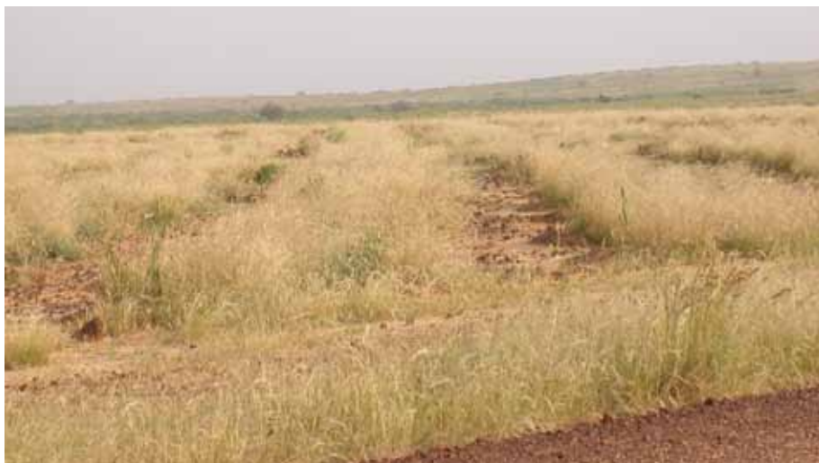
Re-fertilized land: The same recuperated land demonstrating evidence of improved fertility. Souradja Mahaman